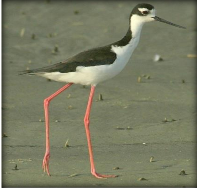
1. Black-necked Stilt L Bright pink legs, Black upperparts