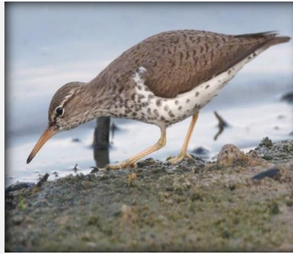
5. Spotted Sandpiper S Tail-bobbing behavior, upperparts highly spotted in summer