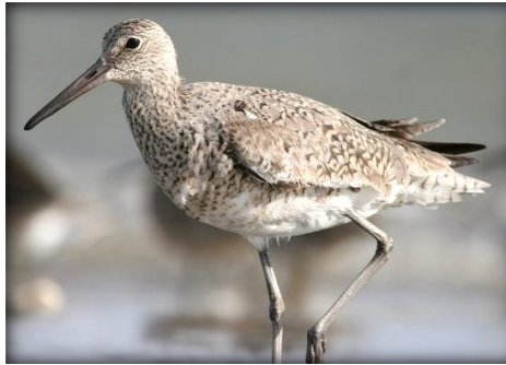
14. Willet L White wing stripe and black outer wing visible in flight