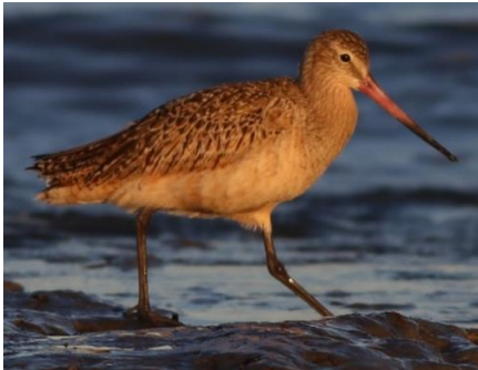
13. Marbled Godwit L Long, bicolored, slightly upturned bill