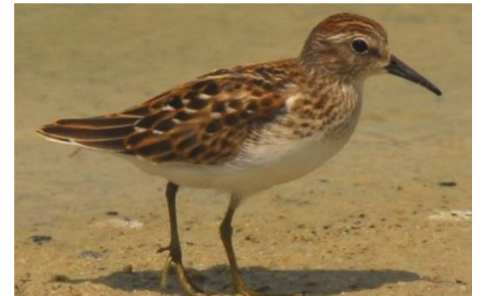
18. Least Sandpiper S Very small size, yellowish legs