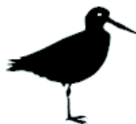
M edium (Robin Size)