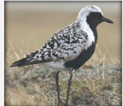
6. Black-bellied Plover M Black wingpits visible in flight