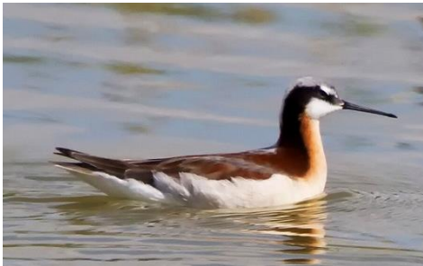
16. Wilson's Phalarope S Dainty, grey upperparts, often feeds by spinning in circles in deeper water