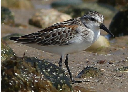
11. Western Sandpiper S Very small size, black legs