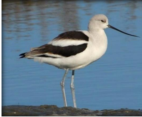
2. American Avocet L Black and white winged, in summer has orange head and neck