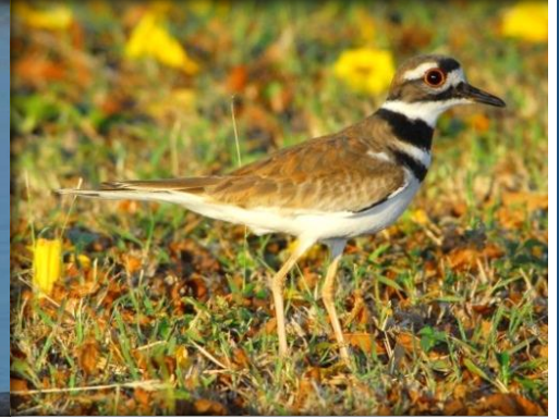
3. Killdeer M Two black breast bands, red eye ring