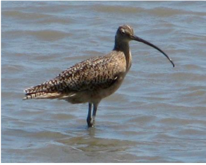
10. Long-billed Curlew L Very long, down-curved bill, warm cinnamon colored underparts