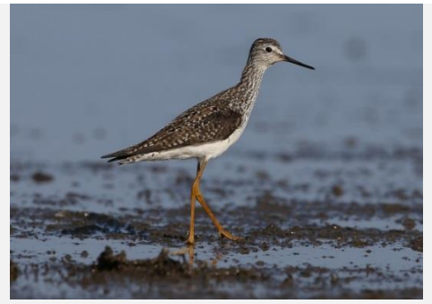
9. Lesser Yellowlegs M Yellow legs, straight bill, call is typically two notes