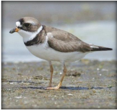
4. Semipalmated Plover S One black breast band, bicolored bill