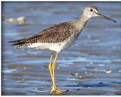
8. Greater Yellowlegs L Yellow legs, long bill, call is typically three notes