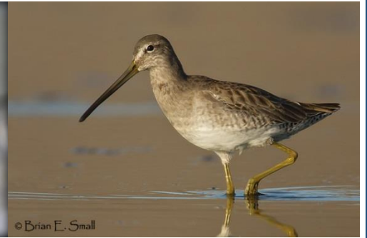
15. Long-billed Dowitcher M Long and straight bill, feeds with 'sewing-machine' type motion, white patch on back visible in flight