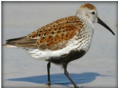
7. Dunlin S Slightly drooping bill