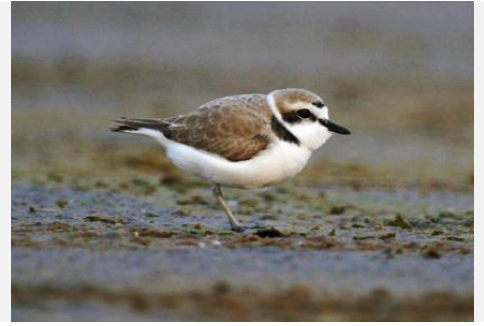
12. Snowy Plover S Small black bill, grayish legs