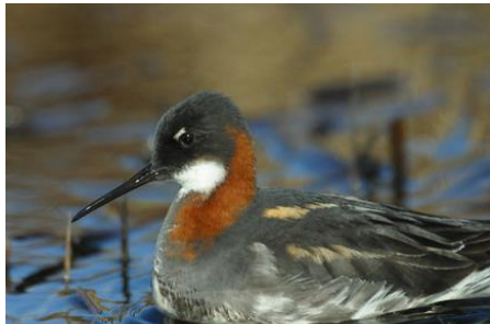
17. Red-necked Phalarope S Very small size, thin bill, often feeds by spinning in circles in deeper water