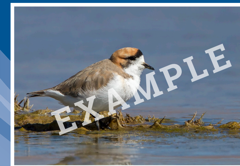
COMMON NAME ( Scientific name ) <Caption about shorebird, population numbers, migration route, or other interesting fact.>