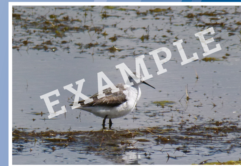
COMMON NAME ( Scientific name ) <Caption about shorebird, population numbers, migration route, or other interesting fact.>