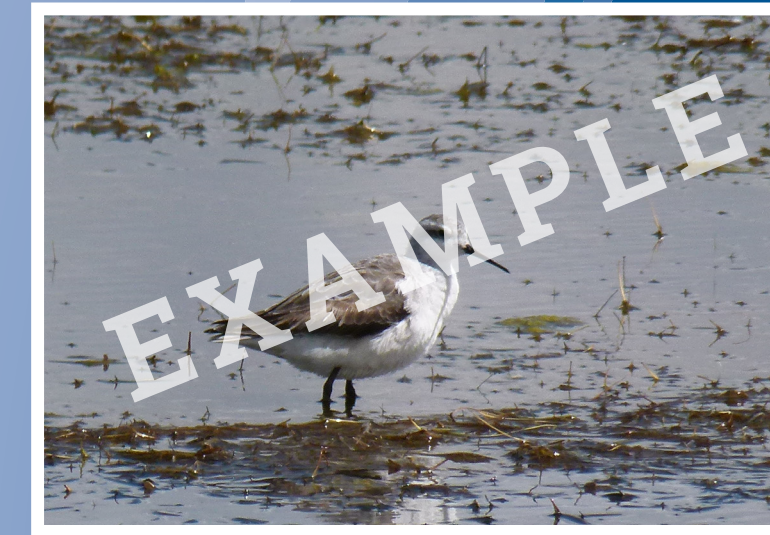
COMMON NAME (Scientific name)