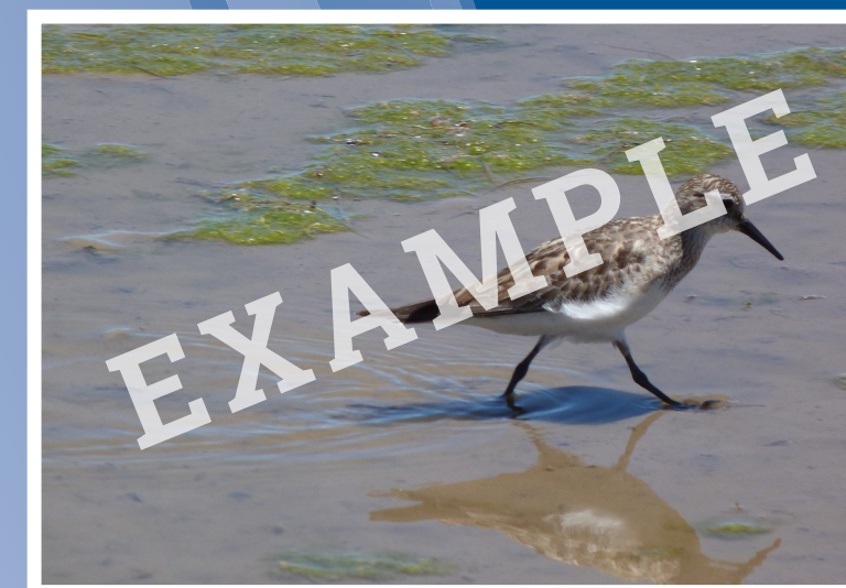
COMMON NAME (Scientific name)