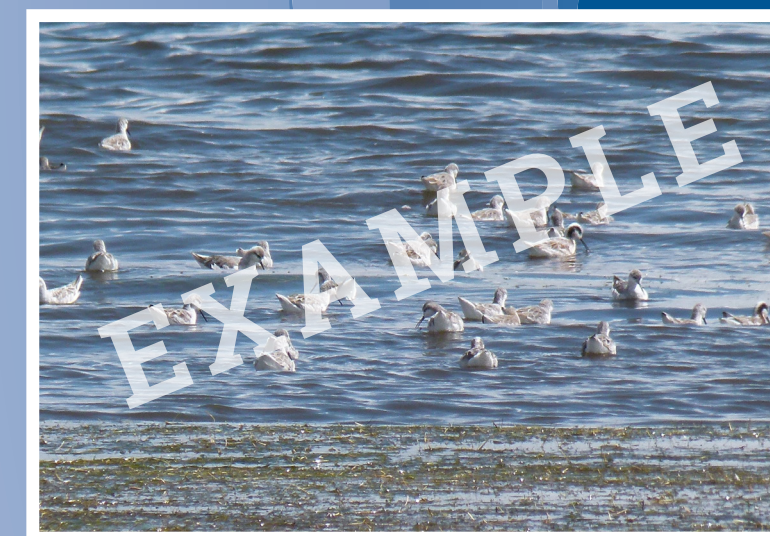
COMMON NAME (Scientific name)